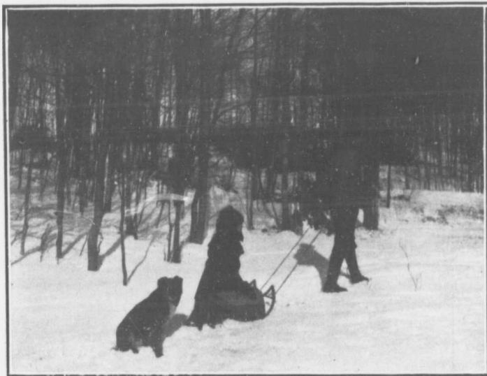
PLEASURES OF COUNTRY LIFE.

Children need outdoor amusements in winter as well as in summer, and if there is the willingness to provide for their needs it can be done without great expense. Free skating rinks should be numerous. Thousands of