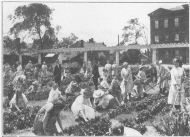
CHILDREN LOVE TO WATCH THINGS GROW.

F OLLOWING will be found some random thoughts and suggestions intended for the help and encouragement of playground workers. Use these ideas freely, in schools, pulpits and press, and, as a result, may playgrounds, properly equipped, and supervised by genuine child-lovers spring up everywhere, diffusing health and joyousness among all the young people of our country!