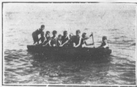
STARTING ON LIFE'S VOYAGE.

THEREFORE, by all means, get a playgrounds association started, and take up some of these much-needed improvements.