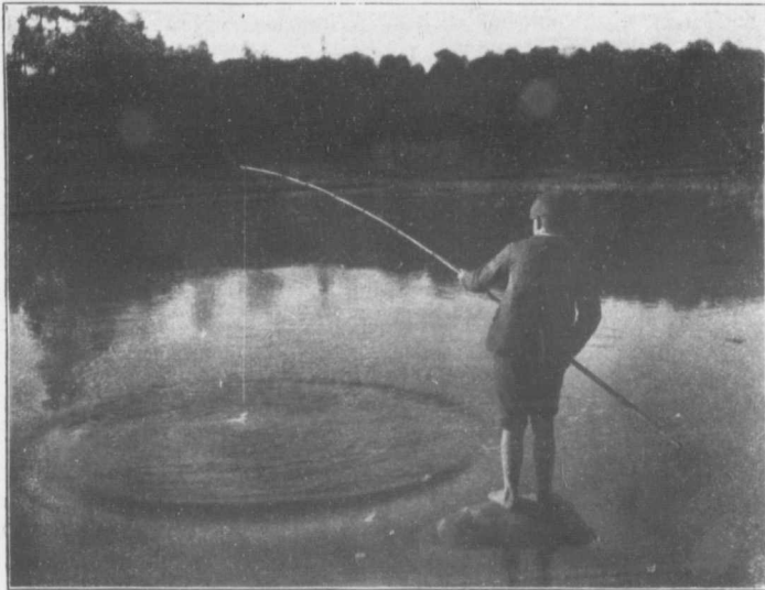
AWAY FROM CITY TEMPTATIONS.