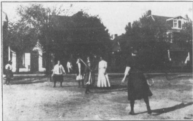
EXERCISE DISPELS HEADACHES.

Play is essential to proper physical development, and moral growth depends to a large extent on free and healthy exercise. It is the right of childhood and it is only reasonable to ask that all the necessary facilities should be provided. To be beneficial it should be wisely encouraged and directed and the undesirable elements eliminated. There should be swings,