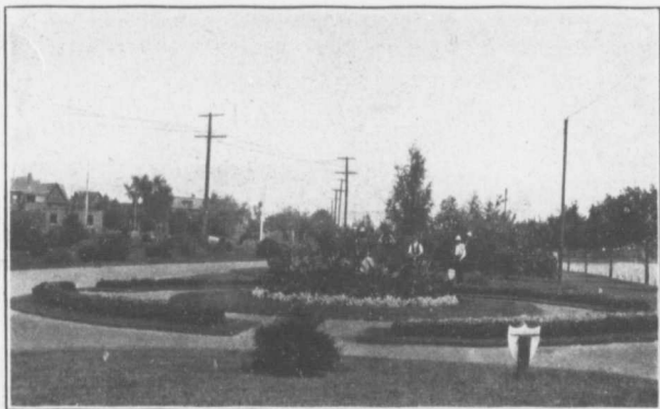
BEAUTIFUL HOME SURROUNDINGS, BUT NO CHILDREN IN SIGHT.

To secure the proper number of playgrounds, rinks, toboggan slides, gymnasiums, bath houses, etc., will require constant agitation for years to come. If the enthusiasm lags they will not be provided, for large expenditure will be necessary. Therefore may we not appeal confidently on behalf of the children to men in authority, aldermen, school trustees, editors, business men, educators—to keep the playground movement constantly in view, giving it their endorsement and advocacy whenever possible, remembering that the best type of citizen can be evolved only from the healthy, robust child, who has had a free and well-rounded youth spent in cheerful and clean moral environment.