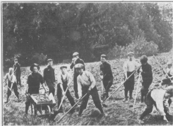
BOYS PLEASANTLY EMPLOYED.

The best type of citizen can be evolved only from the hearty, robust child, who has had a full and well-rounded youth, spent in cheerful and clean moral environment.