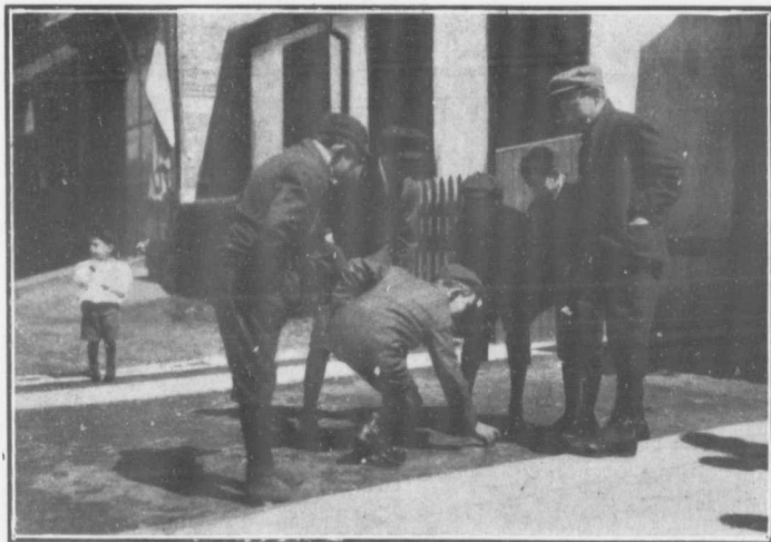
MEN IN THE MAKING.