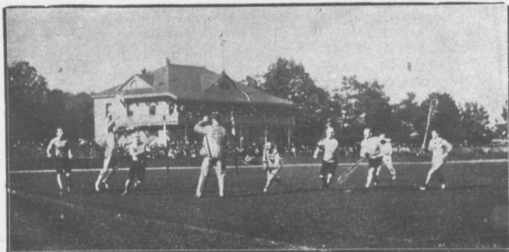
WHERE JIM AND SAM HUGHES PLAYED LACROSSE!

"The position of Toronto with respect to the encouragement of outdoor