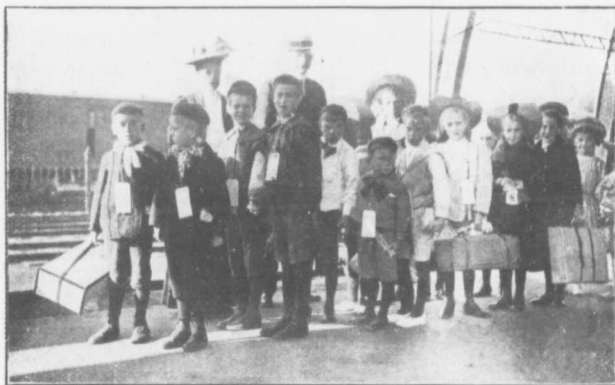
OFF FOR A COUNTRY VACATION.

People should be selected for office who are really interested and willing to exert themselves to make the movement a success. Too often men are elected to office in such societies because of their prominence, and without any expectation that they will be more than figureheads. Enthusiasm can only be sustained by frequent meetings and zealous, active service.