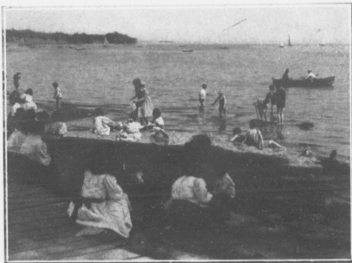
SAVE THE SHORES FOR THE CHILDREN.

A boy's character is formed as much on the playground as in the school-room, perhaps even more so, for in amusements his individuality comes out more strongly.