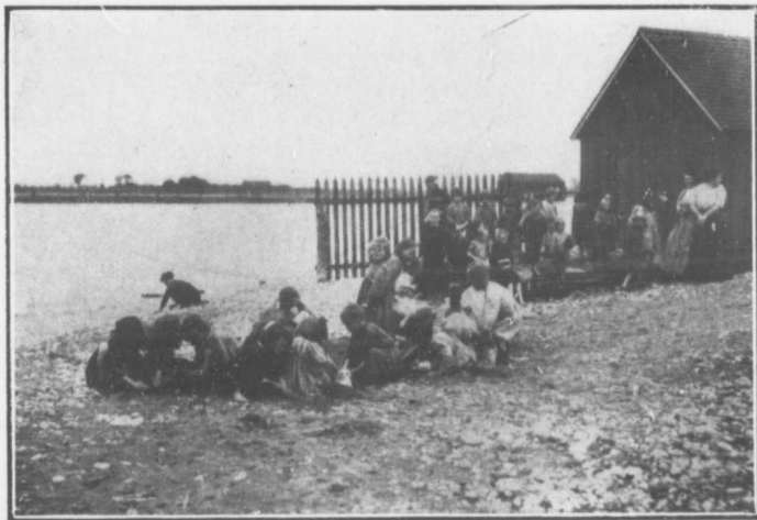
CHILDREN'S FRESH AIR FUND PARTY.

Why not substitute vines, flowers and shrubs for ash heaps, bill boards, rubbish and other things offensive to sight and smell?