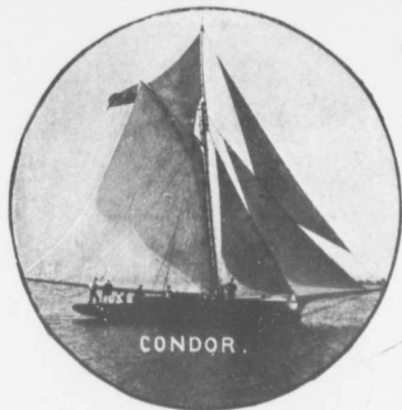
LIFE ON THE OCEAN WAVE.