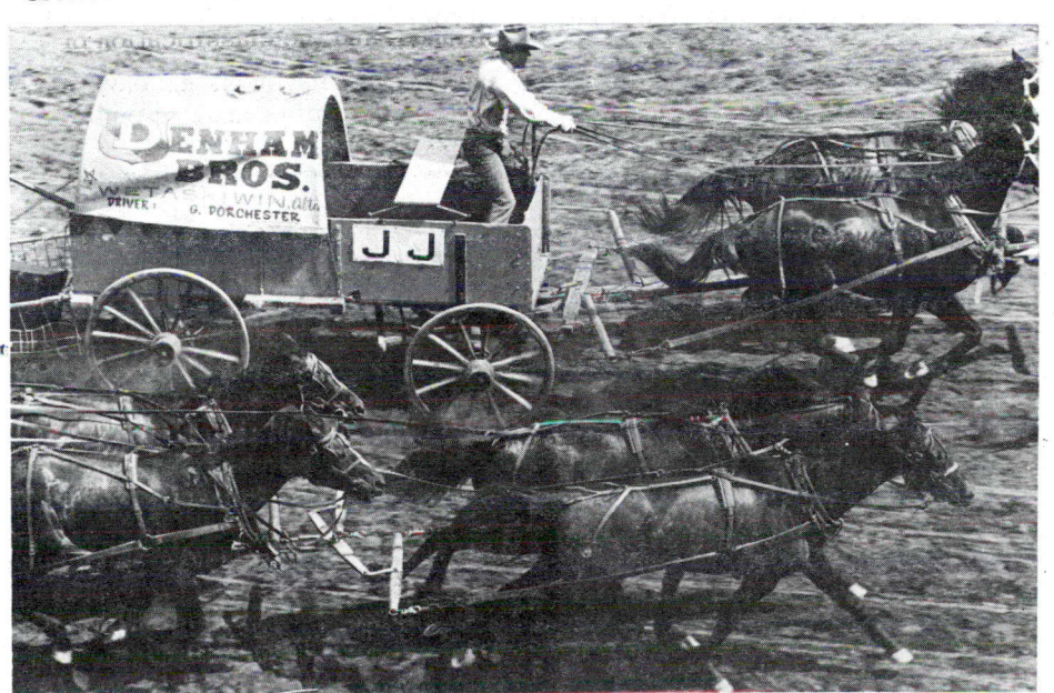
Among the main features of the Calgary Stampede are the chuckwagon races.

Oil was discovered in the Thirties in the Turner Valley, south of Calgary, and in 1947 the major fields at Leduc were tapped. The boom was on and by 1950, Calgary had become the centre of a rapidly-expanding petroleum industry.