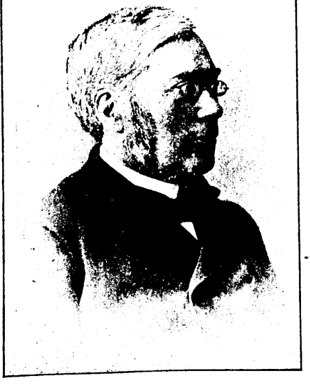
HON. OLIVER MOWAT.

It seems fitting that some respectable record should be made of the facts and the personnel of the Government, at this important epoch in the legislative history of Ontario.