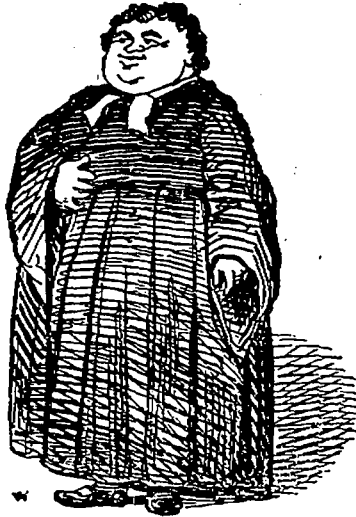
AS HE IS.