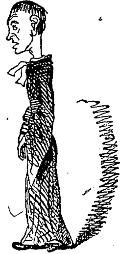
AS HE WILL BE.