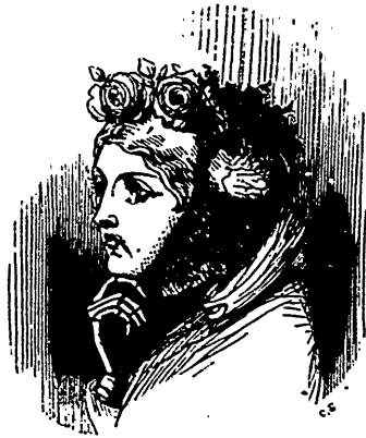
A PAINTED MASK.

He is thy Lord, and worship thou Him. Psalm xlv. 11.