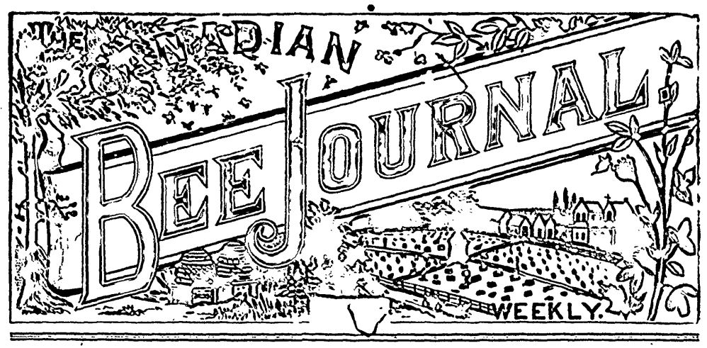
"THE GREATEST POSSIBLE GOOD TO THE GREATEST POSSIBLE NUMBER."