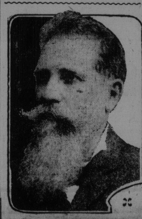
GEN, BERNARDO REYES.