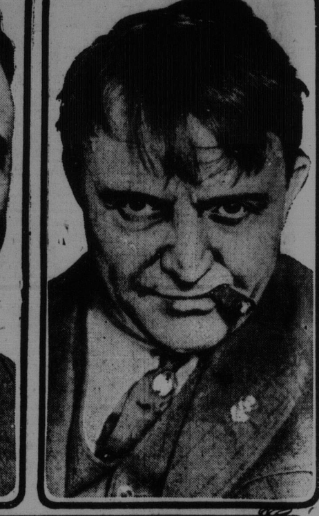
Two photographs of Barney Oldfield, showing the effect of racing's terrific strain on daredevil motorist, who esterday broke all records for speed.