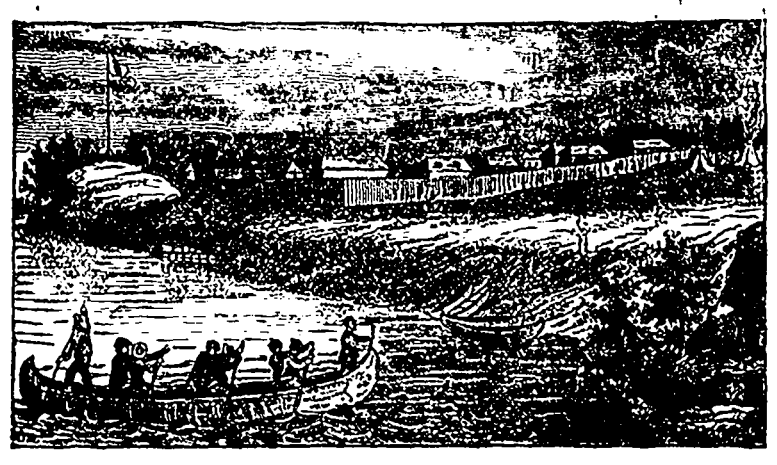
A STATION OF THE HUDSON'S BAY COMPANY.

plain groceries came only once a year, and then only if ordered two years beforehand. Sometimes they were three years on the way, and sometimes failed to arrive at all. A few vegetables were grown in favourable seasons, but often none were available for winter use; and flour was so scarce and costly that bread was to be had once a we k as a treat. However, food such as it was, was plentiful, moose and reindeer meat, rabbits and fish forming the staple food. In starving years which came now and again they were often sadly pinched.