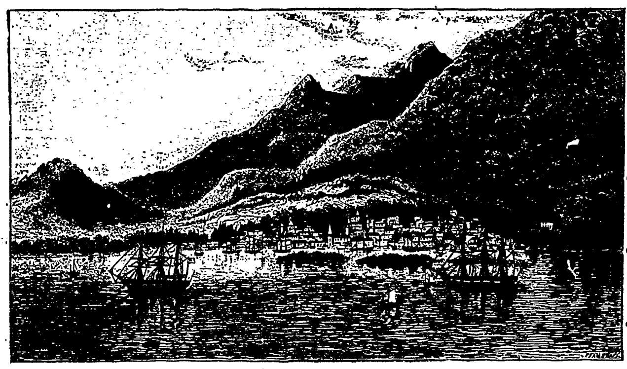
PORT ROYAL, JAMAICA (DIOCESE JAMAICA).