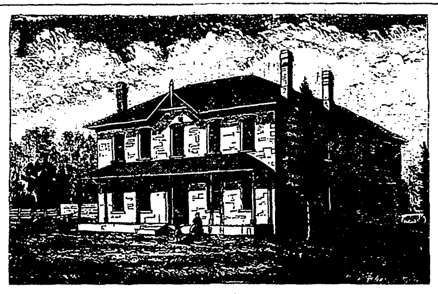
THE WAWANOSH HOME.