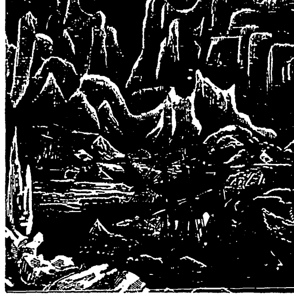
AN ARCTIC SCENE.

crash from natural sleep, only in time to behold the ghastly means of their destruction, and then to sink into the sleep of death from which naught may awaken them but the thrilling blast of the "last trump."