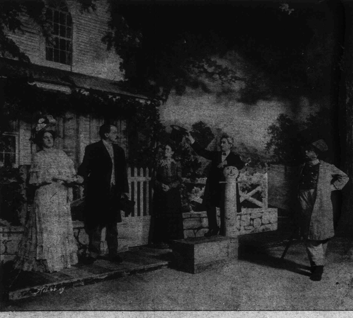
Scene from "My Nephew's Wife"