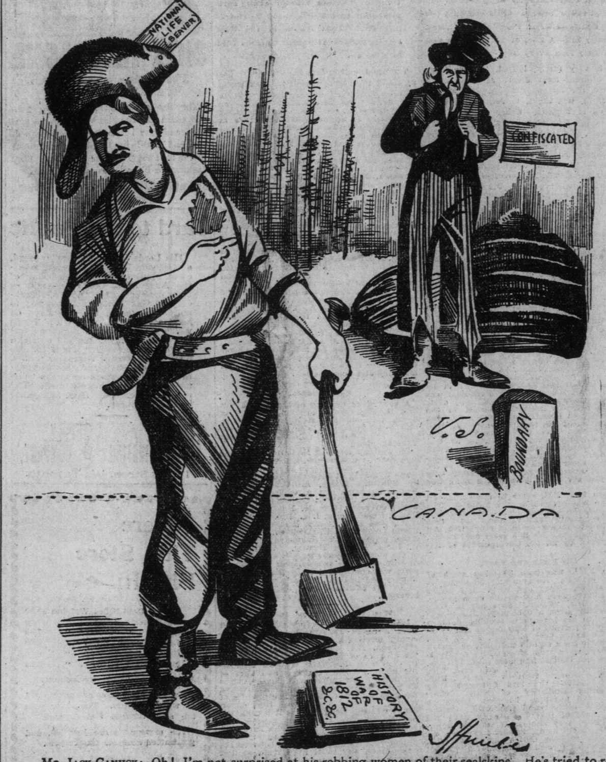
MR. JACK CANUCK: Oh! I'm not surprised at his robbing women of their sealskins. He's tried to rob me of my beaver more than once.