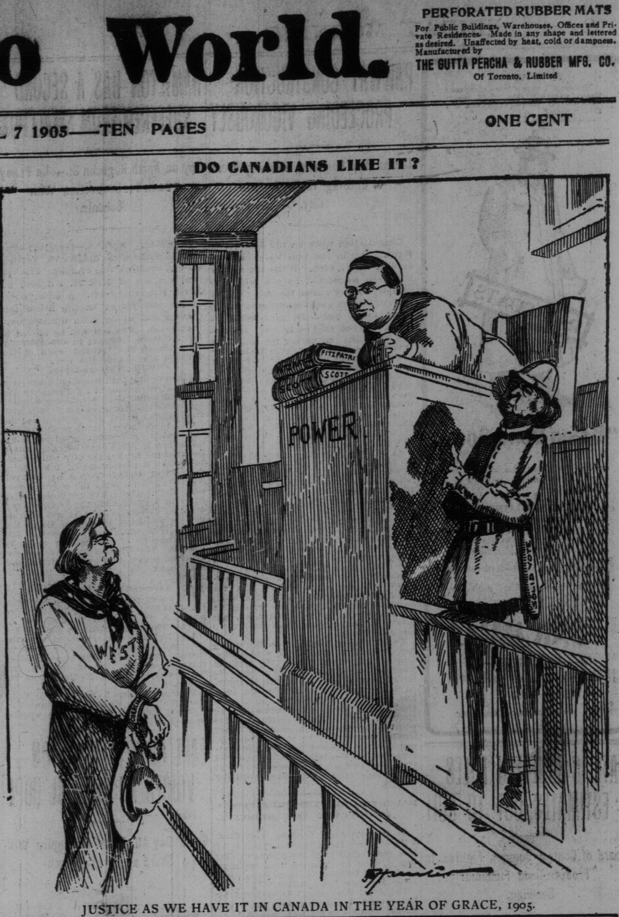
JUSTICE AS WE HAVE IT IN CANADA IN THE YEAR OF GRACE, 1905.