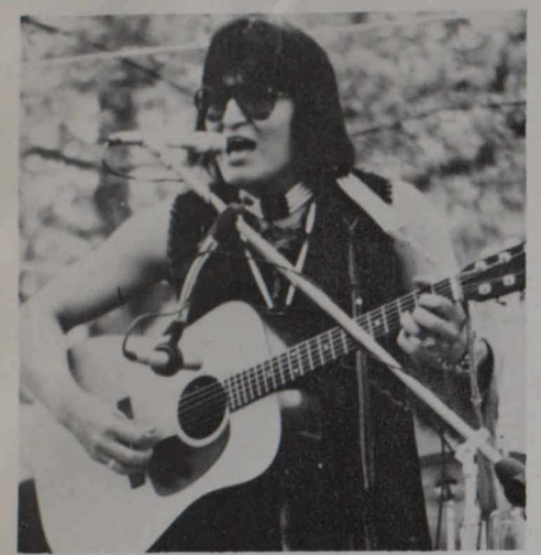
Indian folk singer Shingoose singing in Toronto's High Park. Shingoose prefers to portray the Indian way of life rather than involve himself in red-white controversy.

native people as "the single most enlightened approach to native rights and ownership so far reached."