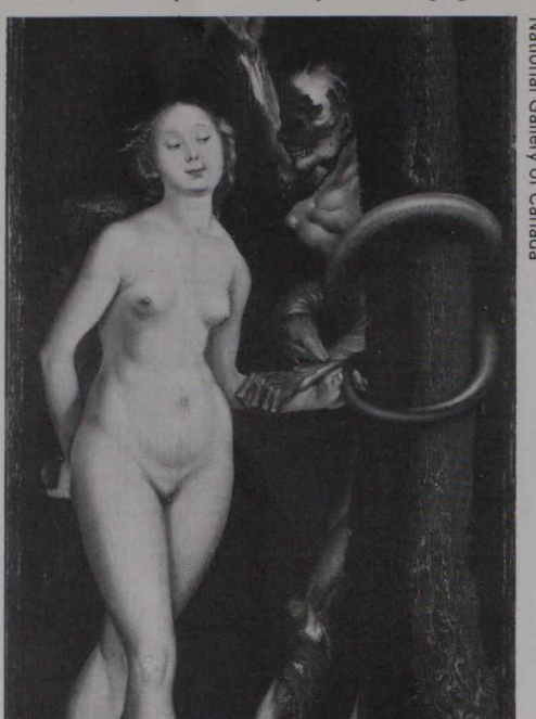
Hans Baldung Eve, the Serpent and Death National Gallery of Canada.

National Gallery—continued from back page.