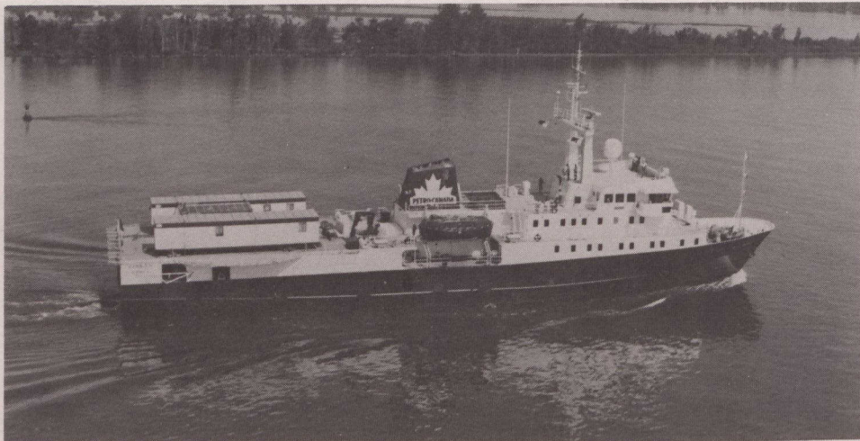
The seismic vessel Bernier , the first Canadian-designed, built, owned and operated ship of its kind. It will be used to re-evaluate offshore hydrocarbon prospects in Haiti and for a marine seismic survey in Sri Lanka.

"No country has put in place the effort required to retrain and educate workers and citizens to use all these new technologies and this is a collective crime," he said. "There is no longer a North and a South — our economies and societies are ravaged, obsolete, outmoded and so many of our citizens are technologically illiterate."