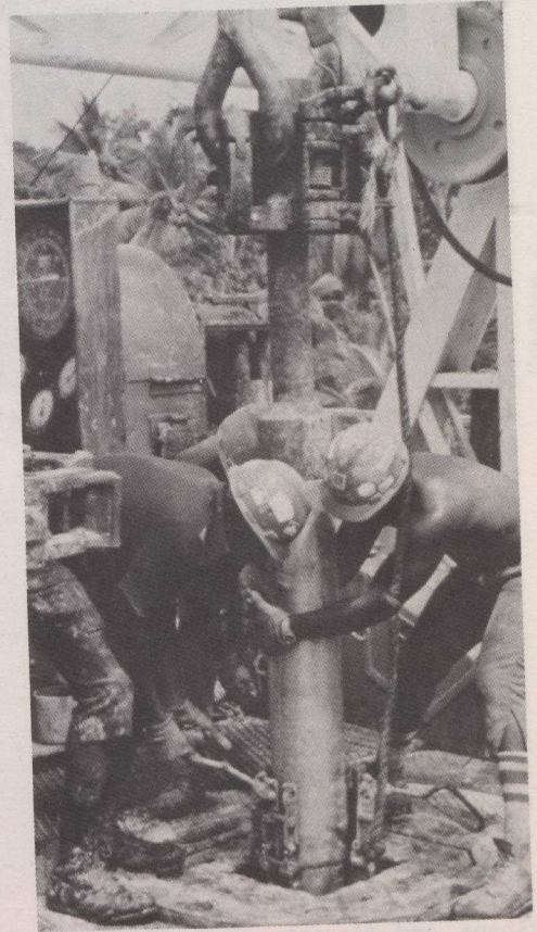
Drilling management in Jamaica is one of several development assistance projects of the Petro-Canada International Assistance Corporation (PCIAC) program.