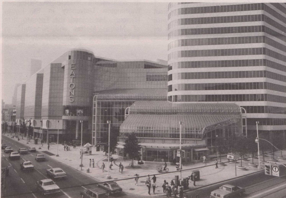
Toronto's prize-winning Eaton Centre, 250-metres long, includes a three-level shopping Galleria with more than 300 shops and joins two large department stores.