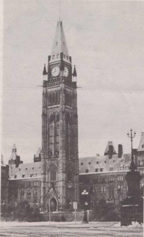
Ottawa's Parliament Buildings

Next summer, Ottawa will join the ranks of such places as Cairo, Athens and France's Loire Valley with a sound-and-light extravaganza on Parliament Hill.