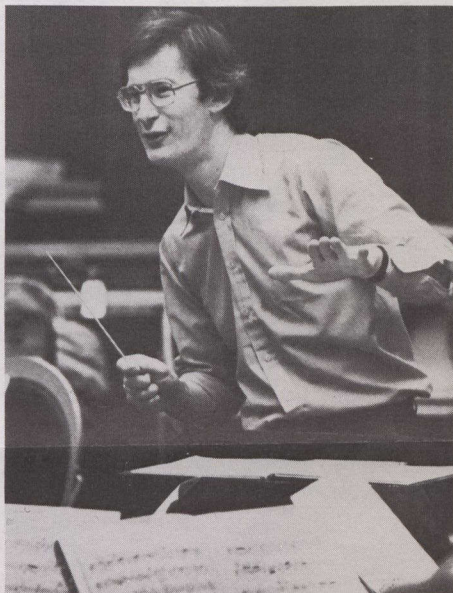
John Eliot Gardiner

Orchestra conducted by Franco Mannino (SM5021).