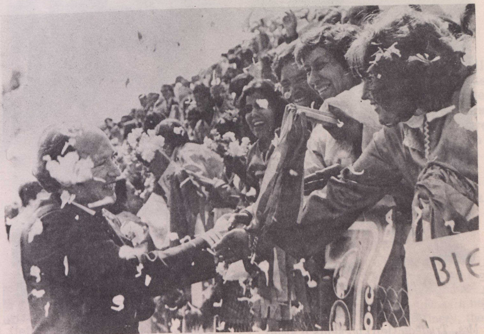
Canadian Prime Minister is showered with blue and white carnations and

confetti on arrival in Mexico City on January 23.