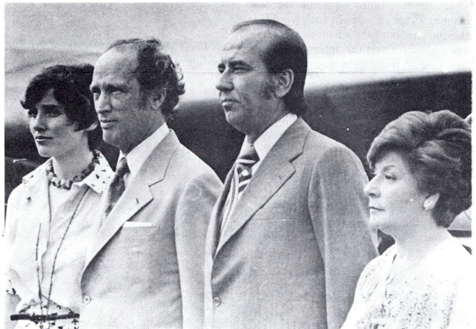
President Pérez and Mrs. Pérez of Venezuela (right) meet Prime Minister

"The two leaders were agreed on the need to preserve the marine environment which constitutes the heritage of future generations and is vital to the very survival of the human race; to develop the utilization of the sea and ocean spaces in a spirit of justice and equality that takes into account the notion that the resources of the sea beyond the areas of national jurisdiction constitute a common patrimony of mankind; and to preserve the living resources of the sea. Conscious of the need to preserve the legitimate rights of coastal states, including their rights over fisheries, and to harmonize them with the interests of the international community, they agreed to co-operate