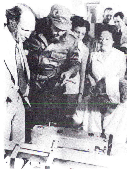
On January 27, the second day of his visit to Cuba, Prime Minister Trudeau (left) tours a textile factory with Prime Minister Castro.

achieved in the expansion of scientific co-operation between the two countries. Special mention was made of the joint work of the Mexican CONACYT [a scientific and technological research organization] and the Canada-based International Development Research Centre in the area of cattle feeding. The President and the Prime Minister agreed that the two governments continue consultations with a view to identifying specific areas where fur-