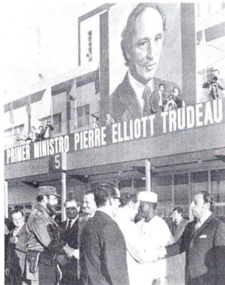
Fidel Castro and Pierre Trudeau greet members of the diplomatic corps on Mr. Trudeau's arrival in Havana, January 26.

achieved in the expansion of scientific co-operation between the two countries. Special mention was made of the joint work of the Mexican CONACYT [a scientific and technological research organization] and the Canada-based International Development Research Centre in the area of cattle feeding. The President and the Prime Minister agreed that the two governments continue consultations with a view to identifying specific areas where fur-