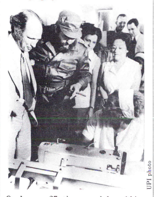
On January 27, the second day of his visit to Cuba, Prime Minister Trudeau (left) tours a textile factory with Prime Minister Castro.

achieved in the expansion of scientific co-operation between the two countries. Special mention was made of the joint work of the Mexican CONACYT a scientific and technological research organization and the Canada-based International Development Research Centre in the area of cattle feeding. The President and the Prime Minister agreed that the two governments continue consultations with a view to identifying specific areas where fur-