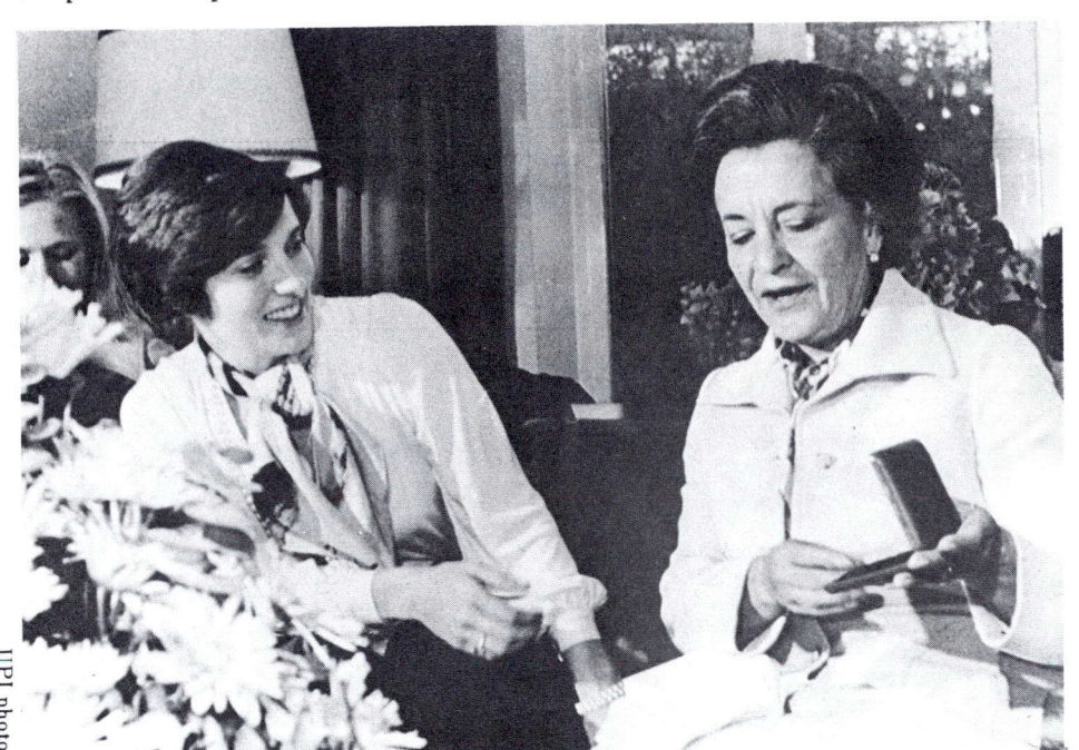
Mrs. Trudeau (left) presents a small gift to Mrs. Echeverria while their

ada's work on the development of the new STOL aircraft. The Mexican side said this matter was under active consideration. A cattle development program, a proposed joint venture in the manufacture of railway passenger cars, further joint ventures in the mining sector, and the tourist industry were