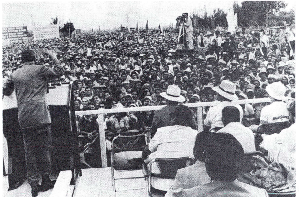
Prime Minister Fidel Castro addresses a crowd of over 20,000 at Cienfuegos, January 28, as Mr. and Mrs. Trudeau

"Both parts also expressed their intention to look for new possibilities which will enable them to continue their collaboration in the field of industrial co-operation. Prime Minister Castro spoke of the planned expansion of nickel production in Cuba and stressed the importance of nickel export earnings to the Cuban economy. Prime Minister Trudeau noted with interest nickel developments in Cuba and agreed that opportunities for cooperation in this area should be in-