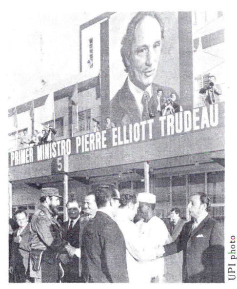
Fidel Castro and Pierre Trudeau greet members of the diplomatic corps on Mr. Trudeau's arrival in Havana, January 26.

achieved in the expansion of scientific co-operation between the two countries. Special mention was made of the joint work of the Mexican CONACYT a scientific and technological research organization and the Canada-based International Development Research Centre in the area of cattle feeding. The President and the Prime Minister agreed that the two governments continue consultations with a view to identifying specific areas where fur-