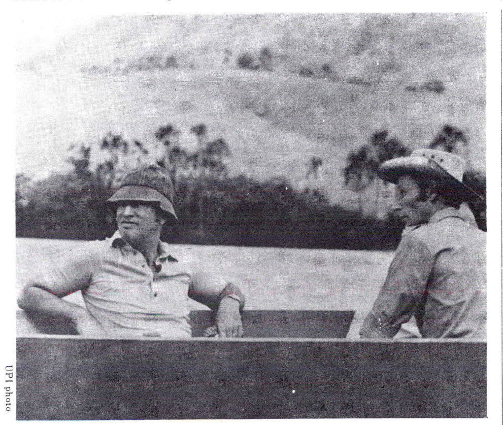
The Prime Minister (left) visits Canaima, one of the national parks, in

"In their talks, the President of Venezuela and the Prime Minister of Canada paid special attention to the prospects for intensifying bilateral