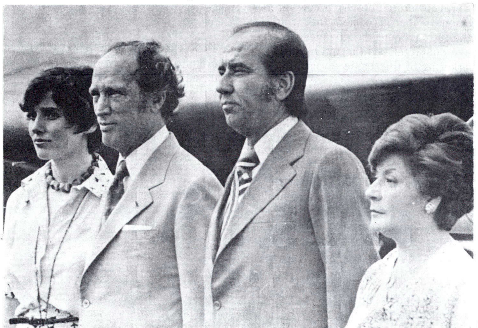
President Pérez and Mrs. Pérez of Venezuela (right) meet Prime Minister

"The two leaders were agreed on the need to preserve the marine environment which constitutes the heritage of future generations and is vital to the very survival of the human race; to develop the utilization of the sea and ocean spaces in a spirit of justice and equality that takes into account the notion that the resources of the sea beyond the areas of national jurisdiction constitute a common patrimony of mankind; and to preserve the living resources of the sea. Conscious of the need to preserve the legitimate rights of coastal states, including their rights over fisheries, and to harmonize them with the interests of the international community, they agreed to co-operate