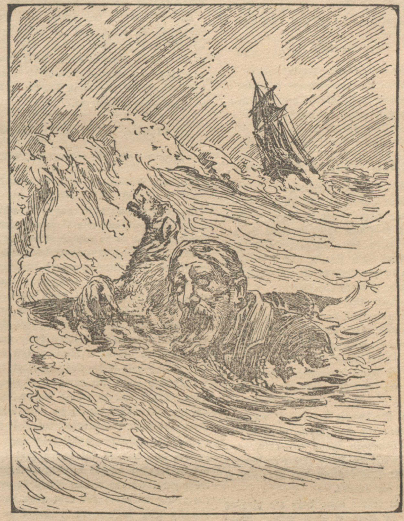
SUDDENLY I WOKE UP, PUNCH WAS BARKING.

'The long hours passed slowly enough. From the top of a wave nothing was to be seen but the heave of the sea, the breaking of foam, and