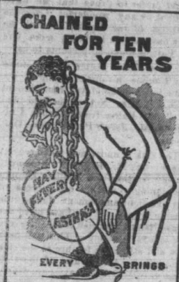
CHAINED FOR TEN YEARS

on arrival of the Express Train from Halifax arriving in Boston early next morning. Returning leave Long Wharf, Tuesday and Friday, at 2 p.m. Unequaled Cuisine on Dominion Atlantic Railway Steamers and Express Trains.