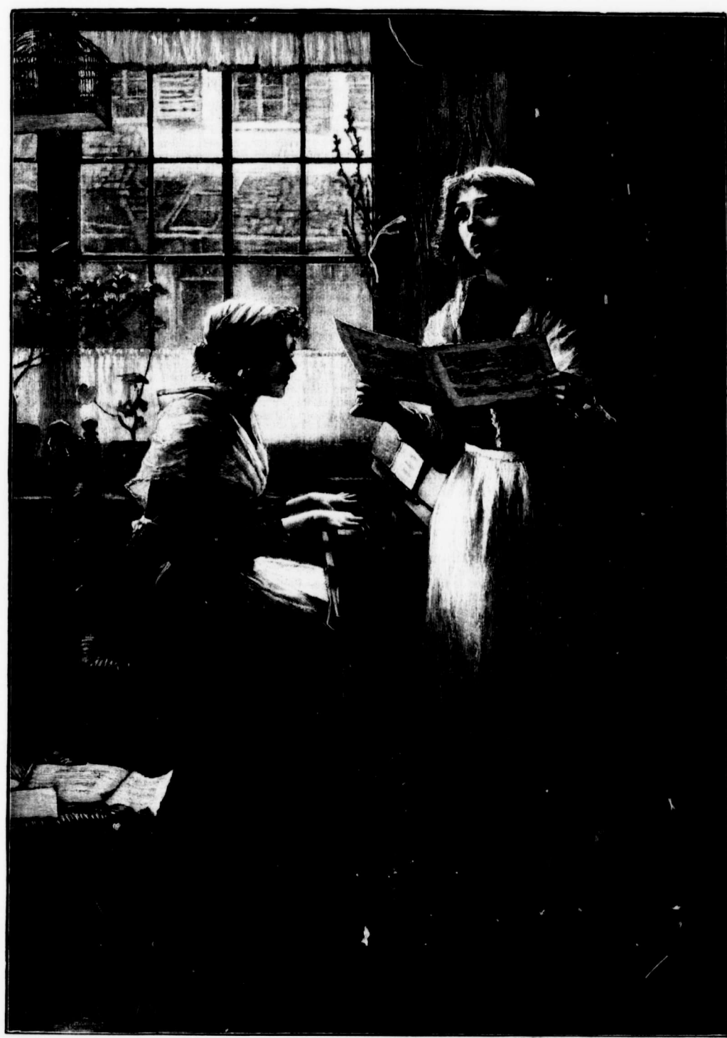
"LOVE DIVINE-ALL LOVE EXCELLING."