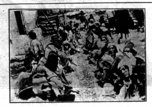
Peniel Hall Farm Indians at their Annual Feast.