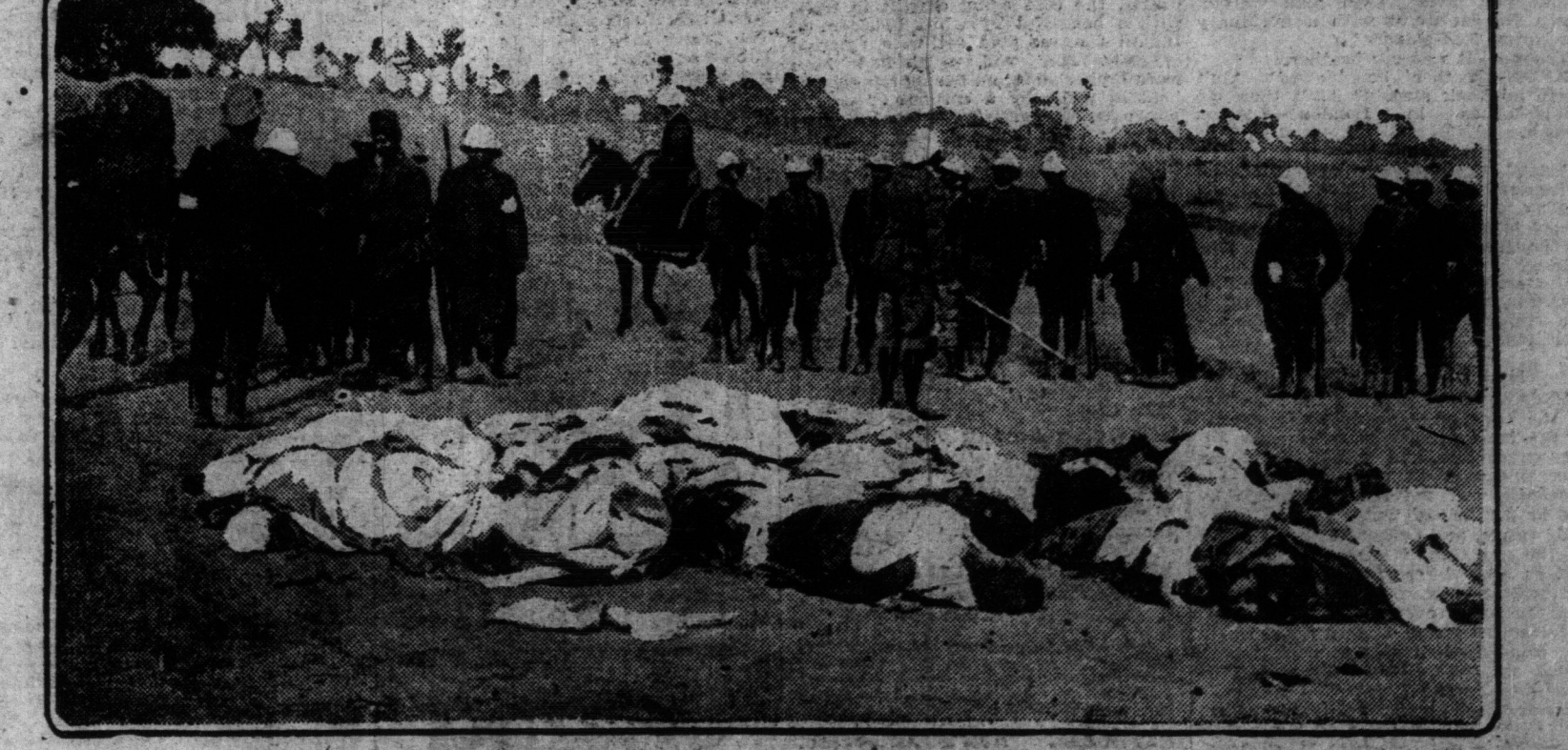
The photograph taken by the camera man of an English newspaper shows a heap of bodies of Arabs, called "traitors" by Italian soldiers, after the firing squad had finished its work.