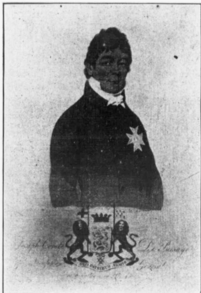
COUNT DE PUISAYE