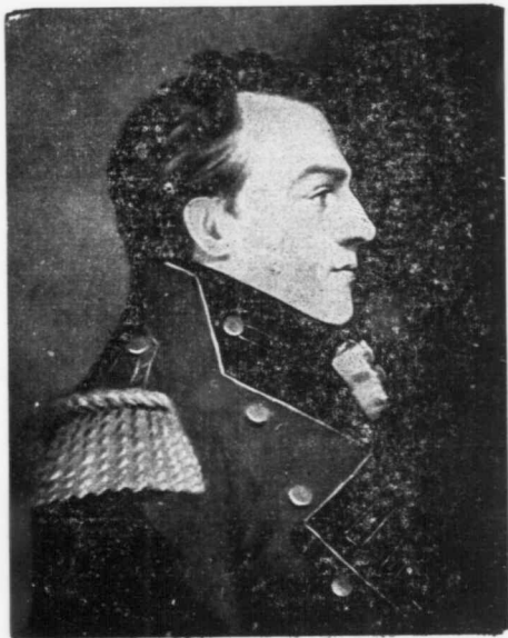
SIR ISAAC BROCK