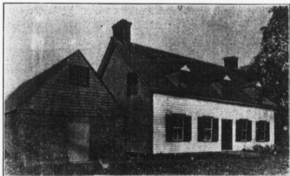
COUNT DE PUISAYE'S HOUSE, BUILT 1799