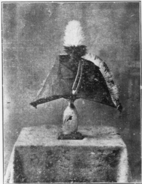
COCKED HAT OF GEN. BROCK