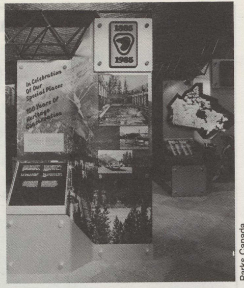
One of the modules in the touring exhibition depicts the natural springs in Banff.

Many exhibitions, ranging from flora and fauna to implements and uniforms, were set up across the country, and a special National Parks centennial exhibition has been on tour in Canada since October 1984. Displayed at 23 major trade shows, fairs, cultural centres