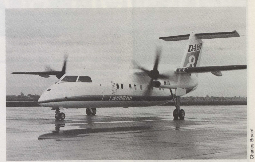
De Havilland nets record sale for its Dash 8 commuter aircraft.

De Havilland Aircraft of Canada Limited has signed a contract with Horizon Air of Seattle to supply ten Dash 8 commuter airplanes with an option for an additional ten. The deal is the largest single commercial order of any aircraft manufactured by the company and could amount to almost $200 million if all the planes and spare parts are purchased.