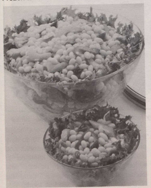
The bean crop of 2 500 producers in Ontario is marketed to more than 71 countries.