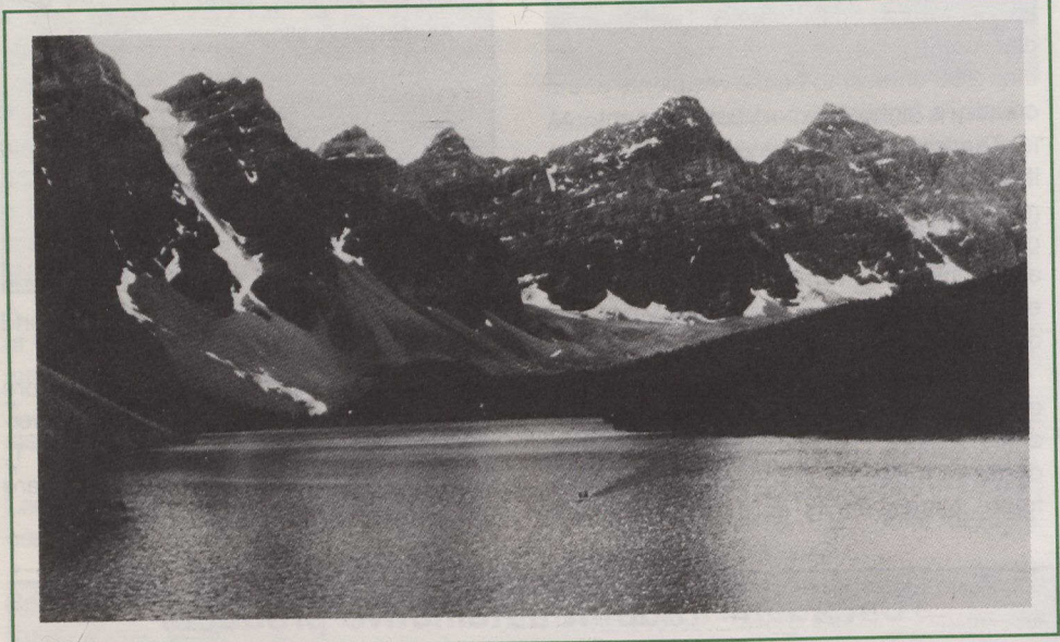
The mountain peaks towering above Moraine Lake in Banff National Park are one of Canada's best-known vistas. The view appears on the reverse of the country's $20 bills and is featured on the $2 definitive stamp issued by Canada Post to mark the Banff centennial.

All of Canada's national parks are managed by Parks Canada. Numerous volunteers assist in many of the programs which