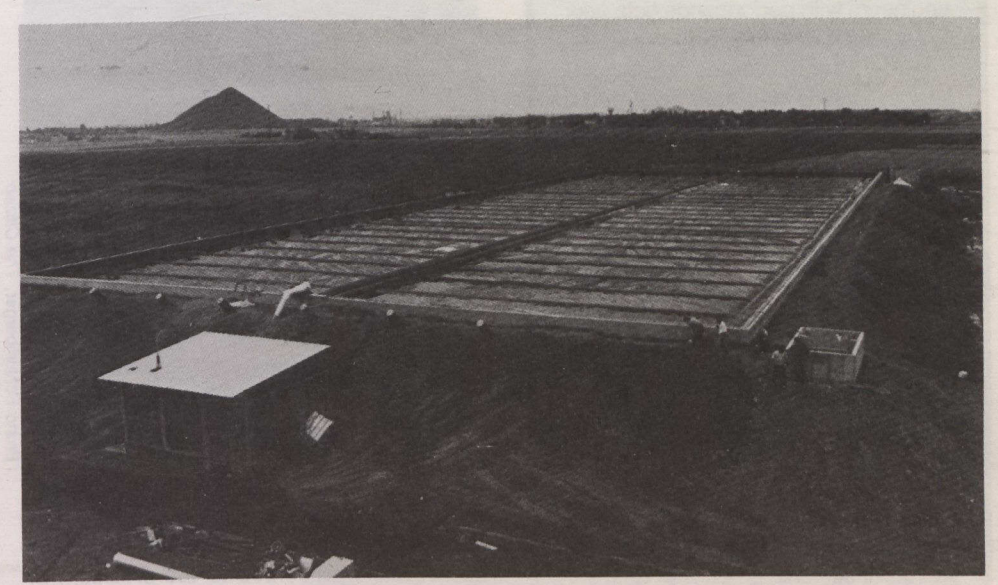
An anaerobic treatment project, designed and constructed by ADI International Inc. of Fredericton, New Brunswick, nears completion in France. The company, which specializes in complete anaerobic wastewater treatment systems for industrial applications, was one of 15 participants in the Canadian exhibit at the fifty-eighth annual Water Pollution Control Federation Conference/Exposition in Kansas City, Missouri, October 6-9.