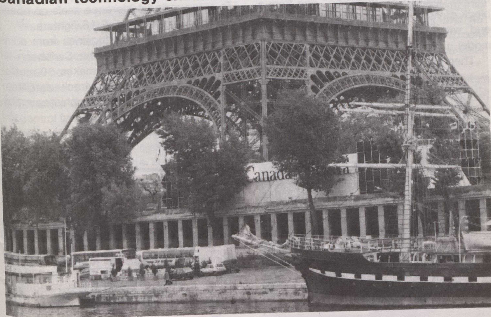
Canada's exhibit dominated the Quai Branly site beneath the Eiffel Tower.

TECHNICANADA, a unique Canadian technology solo exhibit featuring 60 Canadian companies captured the interest of 26 800 French and foreign visitors last month. Held in Paris, France, the TECHNICANADA structure dominated the Quai Branly site at the foot of the Eiffel Tower.