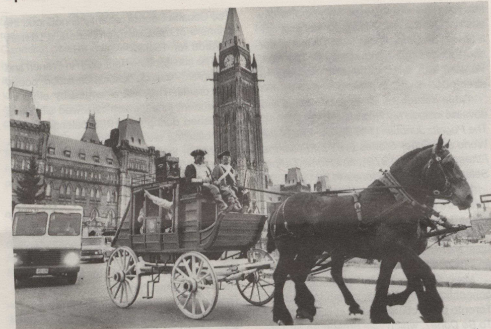
This copy of an Upper Canada stage-coach left Ottawa recently for Toronto, recreating the Ottawa-Toronto mail run from the time of the mid-1800s. The coach carried letters of congratulations from former Prime Minister Trudeau and members of Parliament to Ontario premier William Davis and the people of Ontario. The journey is part of Ontario's two-hundredth birthday celebrations.