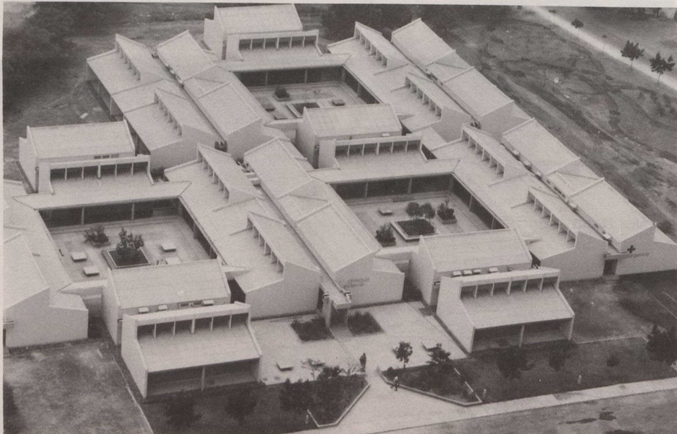
The Albert Royer hospital in Dakar, Senegal, is the winner of a prize for architectural excellence awarded by the Order of Quebec Architects.