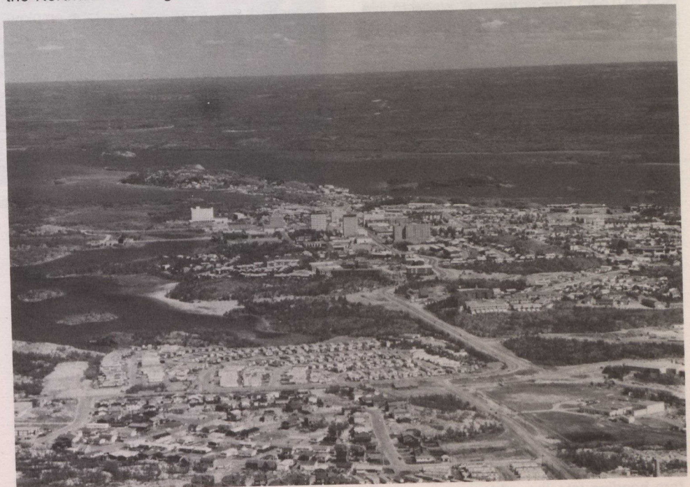
Yellowknife is now a thriving city of 10 000 people.

"There was a mining-town mentality, where people planned on staying a couple of years, that has been replaced by a grow-