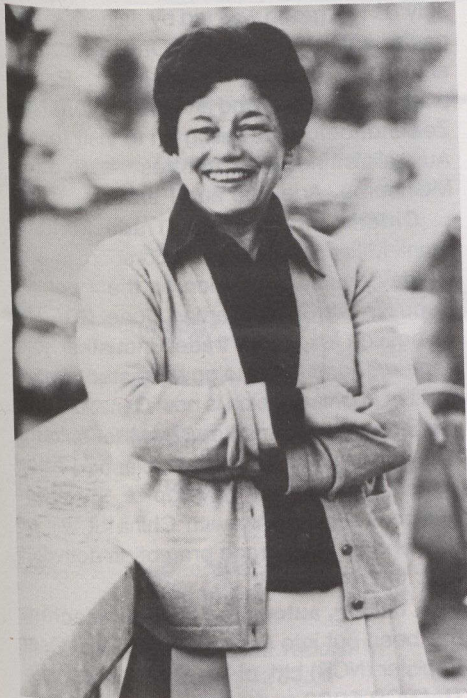
Award winner Mavis Gallant.

Mavis Gallant, Canadian novelist and short story writer, has won the Canada-Australia literary prize for 1983.