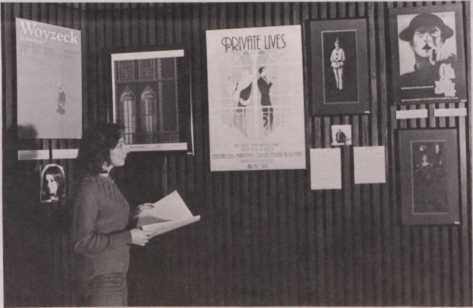
Some of the posters displayed at the National Arts Centre.

The Centre has commissioned a commemorative poster to be designed, symbolizing the celebration of the performing arts. It uses the eye of an actor's mask as the focal point and, through the combination of five colours, relates to each of the performing arts. The poster is to be printed in two limited editions, one of which will be a collector's edition signed by the artist.