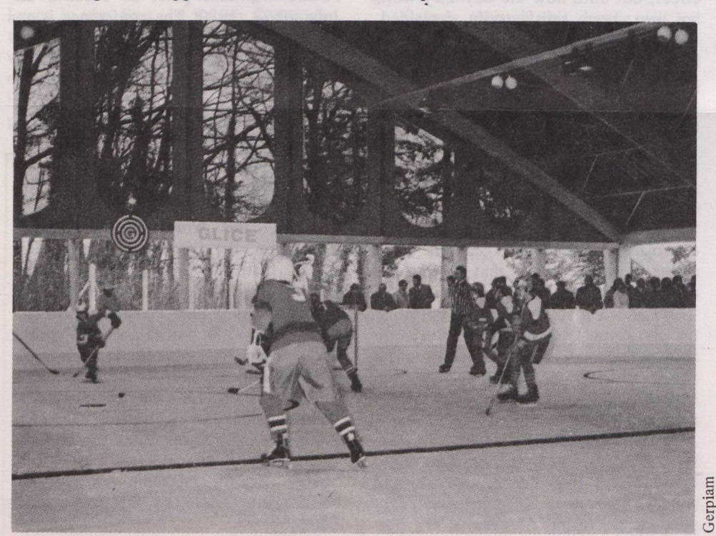
Young hockey players in action on the plastic Glice rink.

The Glice rink does need a roof over it because the sun or rain can damage the wood between the two layers of plastic but it is expected that more and more of these plastic rinks will have cement cores.