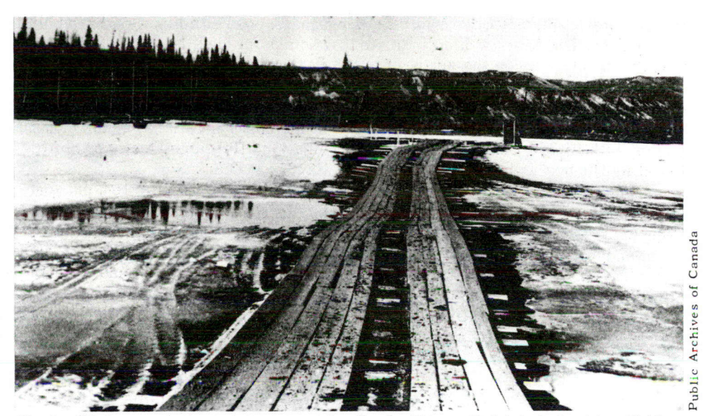
Alaska Highway construction across the Peace River, British Columbia, 1942.

Jurisdiction over the Canadian section of the highway was turned over to the Canadian army in 1946 and all reconstruction and upgrading was carried out under Canadian army supervision until April 1, 1964 when the federal Department of Public Works took it over. On April 1, 1971, the maintenance of the Yukon section of the Alaska Highway was turned over to the