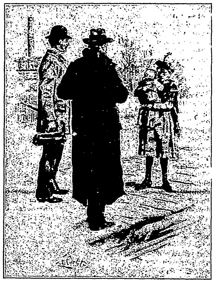
"BE YOU THE BOARD?"

She took a fresh grip on the baby, who seemed to require constant and difficult readjustment; and the board, being kindly disposed, extended