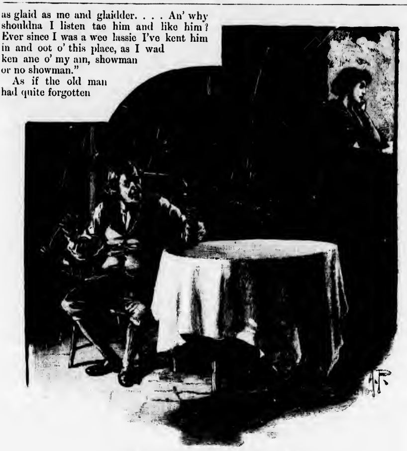
" Brought his hand down on the table beside him angrily."

what he had previously said, he added, less gruffly and a little abstractedly: "Ye'll maybe see him the nicht, for the morn is Beltane."