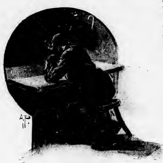
"He sat down and dropped his forehead on his clenched fists."

toliawers instantly levelled their rifles at us some of this fresh meat,"—pointing to the them.