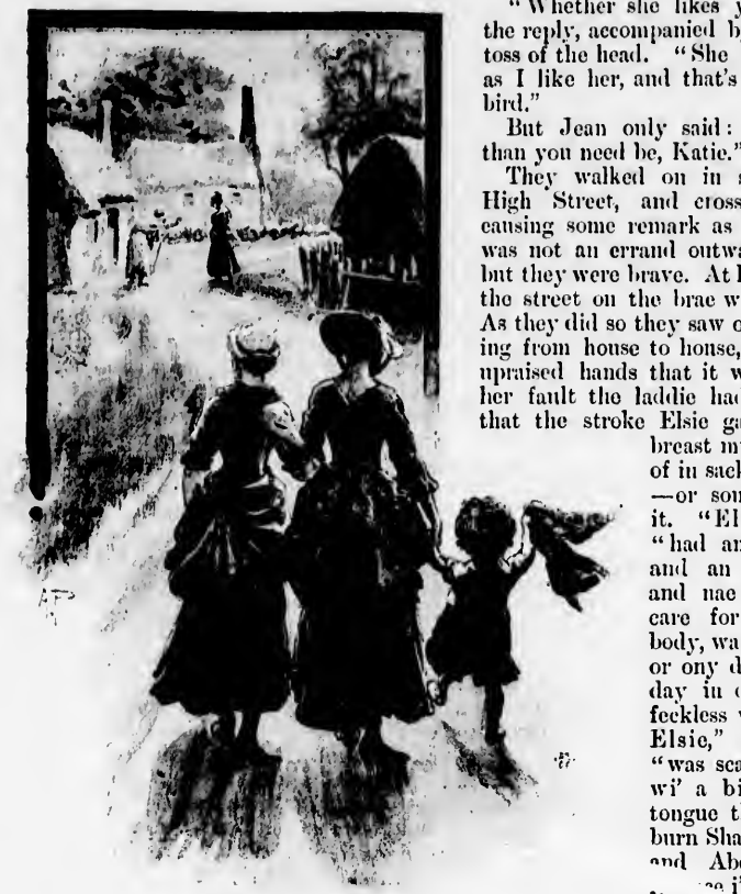
"Old Jessie, protesting with upraised hands."