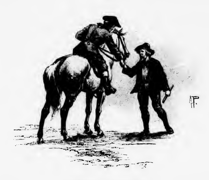
"Good-day to you, sir-Adventurer."

"It's you, Benoni," she responded, "it's you!" "Yes: whom did you expect?" His