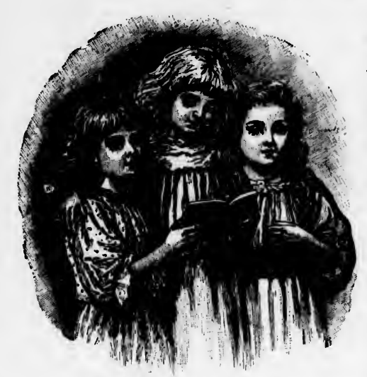
THE CHRISTMAS CAROL.

"The First Test of a truly Great Man is his Humility."- Russin.