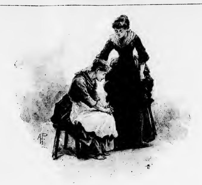
"We will be freens."

"He was a drunkard, and worse," rejoined the other sharply.