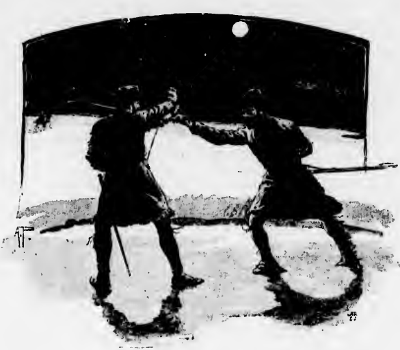
"They sawed and clashed."

war, with uckskins, roup, the rees were imid and lees of the from the and eager . The air the pores of their