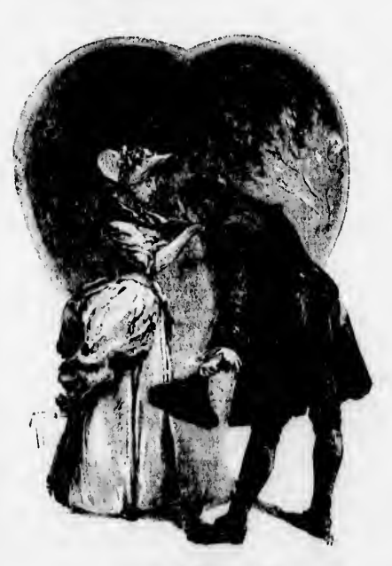
" Li. ted her hand to his lips."

"I—I am very sorry; but must you go ?" "There's only one thing that would keep me," he replied.