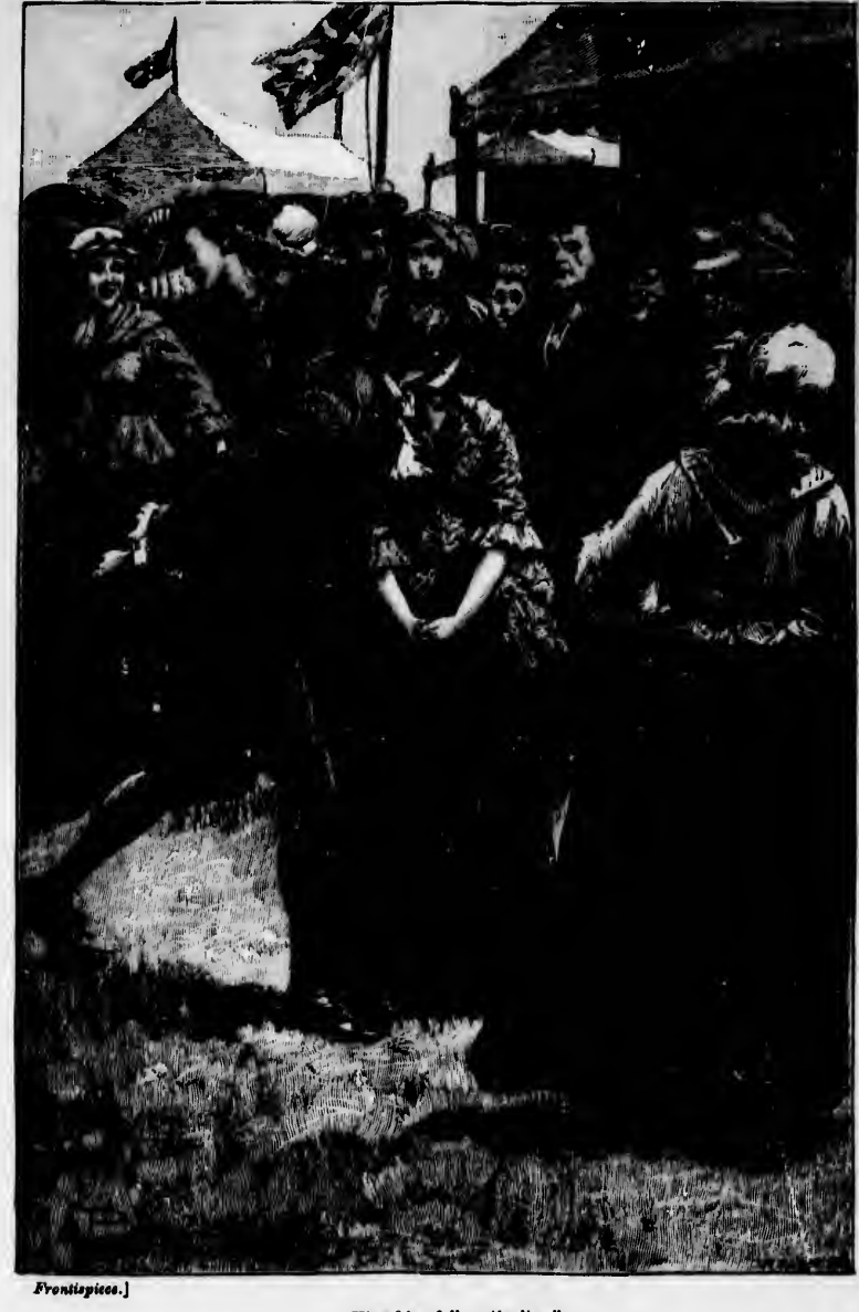
"Kissed her full on the lips."