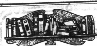
ST. SWITHIN'S DAY

THE pranks played by tradition with the memory of various notable individuals, saintly and otherwise, are unpretentiously the most whimsical amusements both as regards past and present.