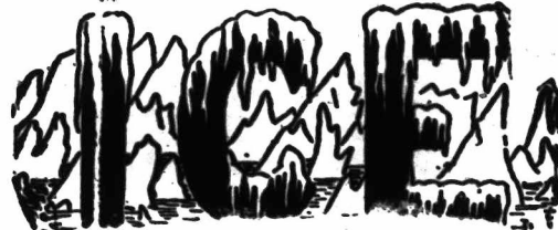
THE BEST FOR HOUSEHOLD USE.

It is clear as crystal and entirely free from snow and all impurities, every block being specially treated after leaving the water.