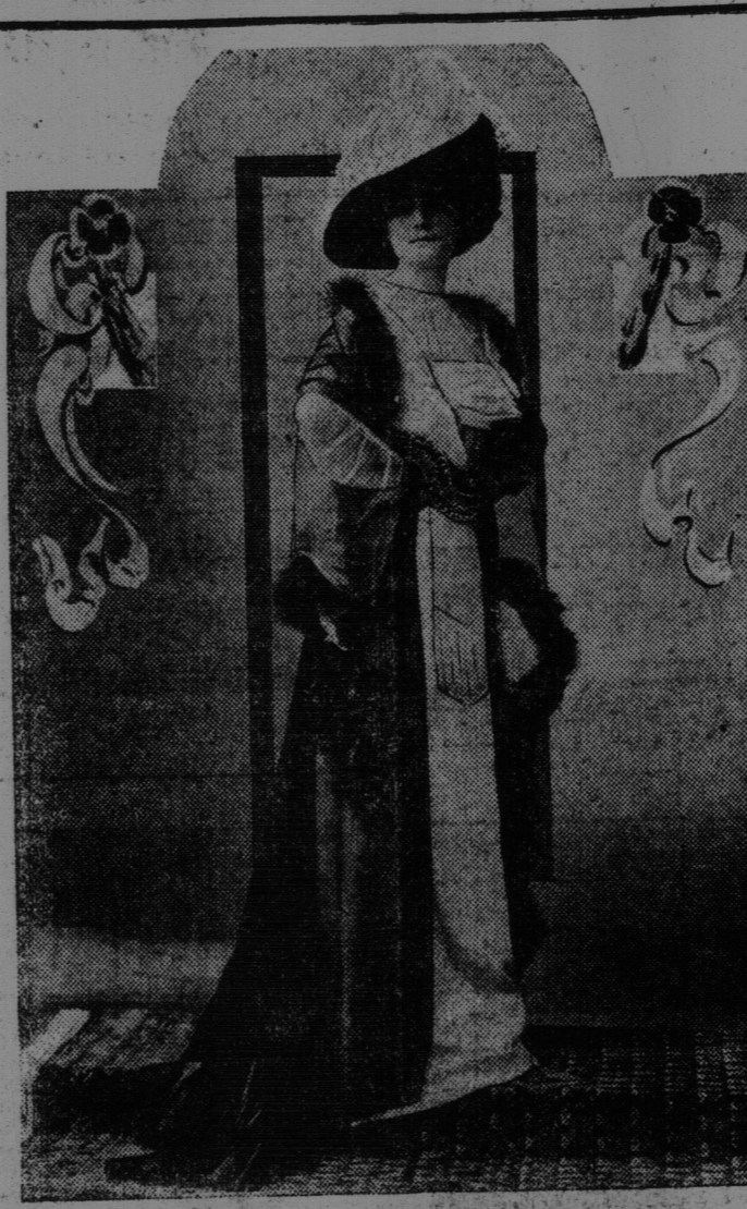
THEATER GOWN AND WRAP. Though having the effect of a pronounced décolletage, this satin frock is made "high-necked" enough to pass muster for theatre and restaurant wear.