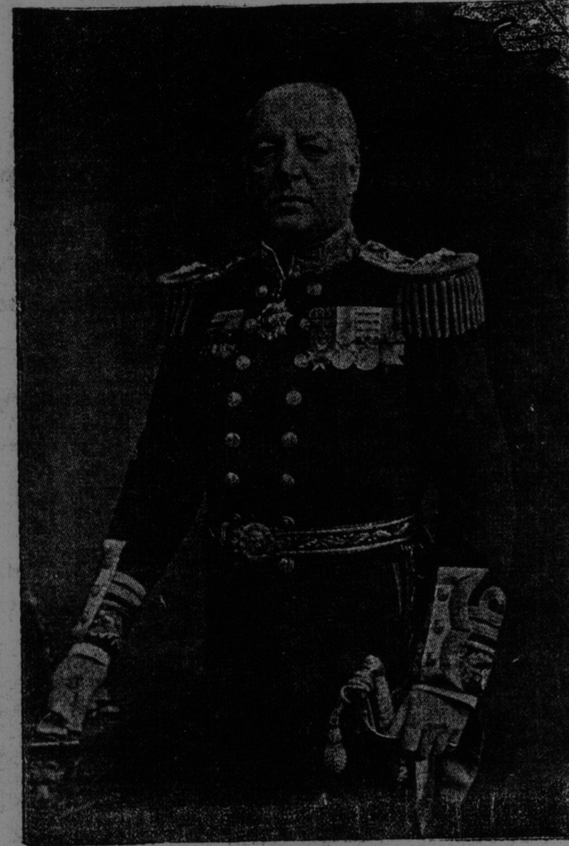
ADMIRAL SIR CHARLES BERESFORD.