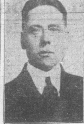
Secretary Ottawa Firefighters' Union.