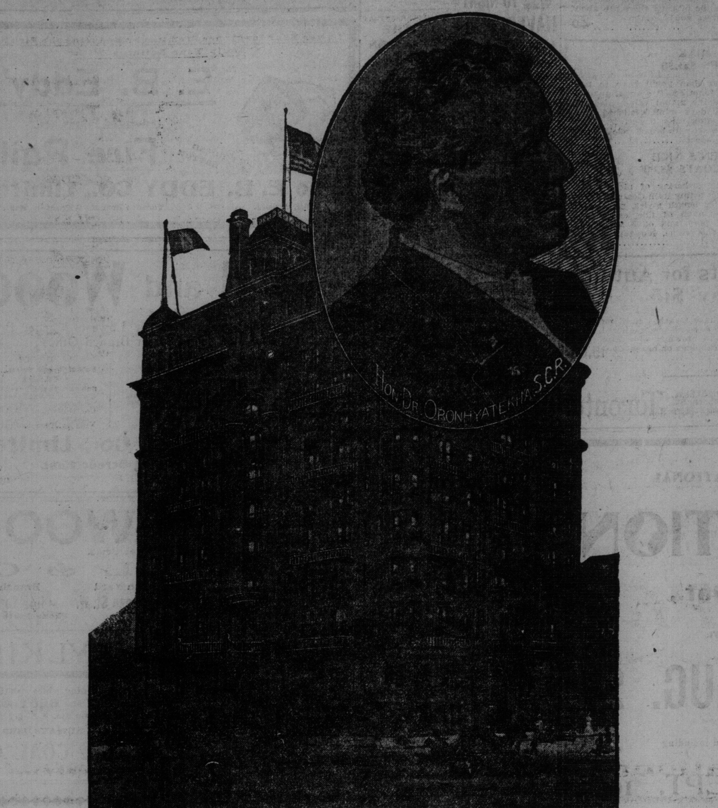
TEMPLE BUILDING, TORONTO

The executive of the Independent Order of Foresters at a recent meeting decided on the purchase of fifty high-grade Pianos to be used in connection with their organization work.