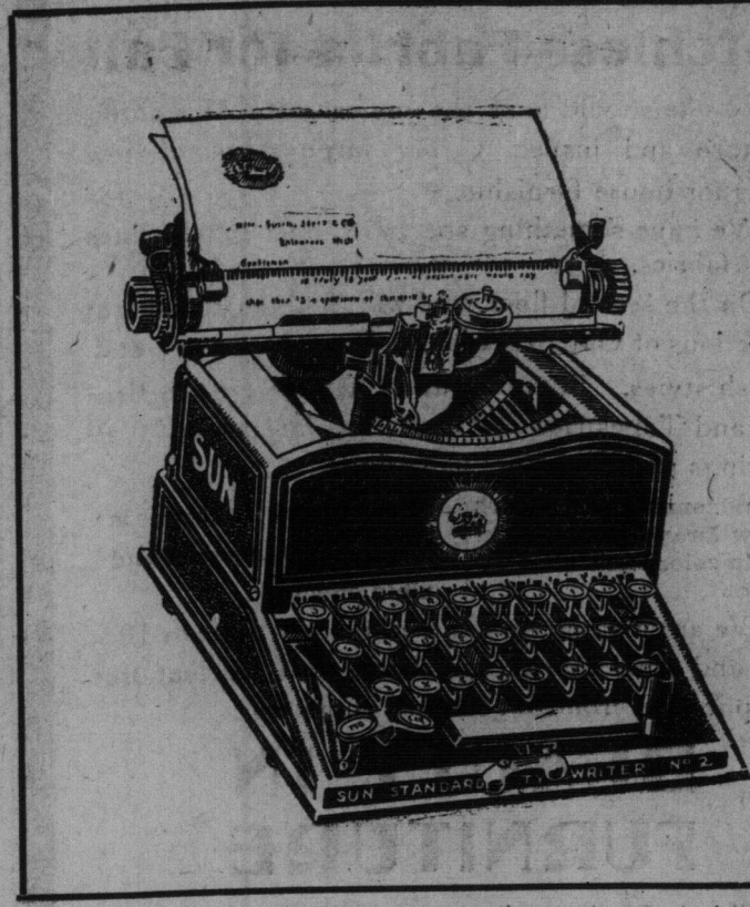
No 2 Model takes in paper 8 1/2 inches wide and sells at.....$55.00