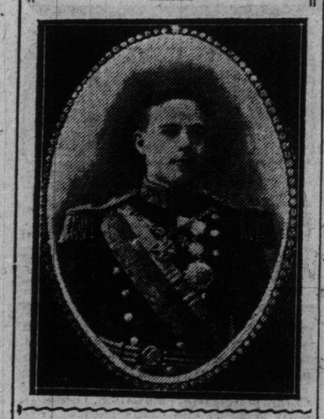
SIR JAMES IS PLEASED WITH THE LONDON OFFICE

Premier Says It is Doing a Great Work in Directing Attention Toward Ontario.