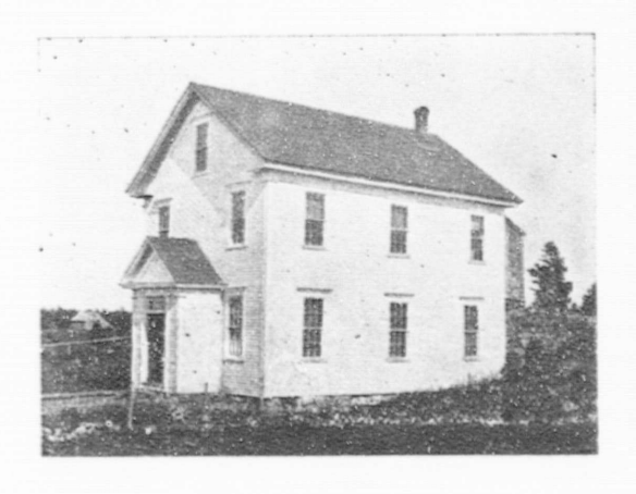
Baptist Church at Harmony, Nova Scotia.