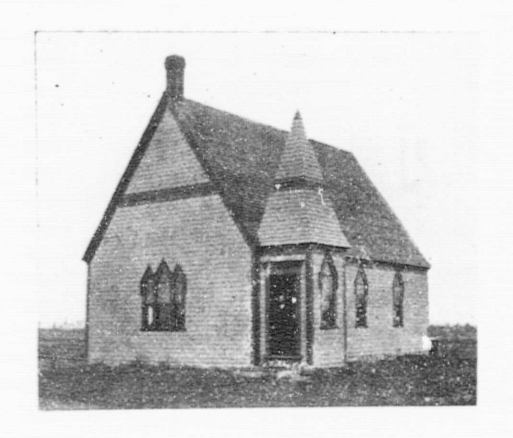
Baptist Church at Meadow Vale, Nova Scotia.