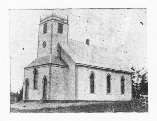
Baptist Church at Tremont, Nova Scotia.