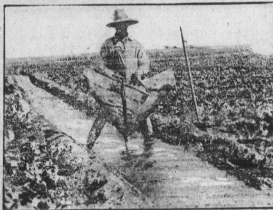
Irrigating Sugar Beets.

More than twelve years ago the possibilities of sugar beet production in Alberta had been recognized, and is giving evidence before a commit-