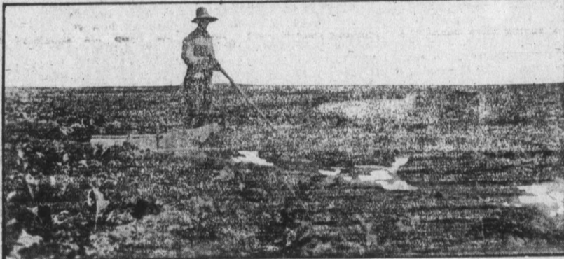
Acres of Sugar Beets.

It is perhaps not generally known that the sugar beet is one of the best growing crops in Western Canada. Not only does this crop grow well, but there is no doubt that with the necessary labor and capital one of the most successful industries in Canada can be built upon the cultivation of beets for sugar.