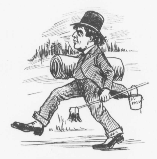
THE ADVANCE AGENT