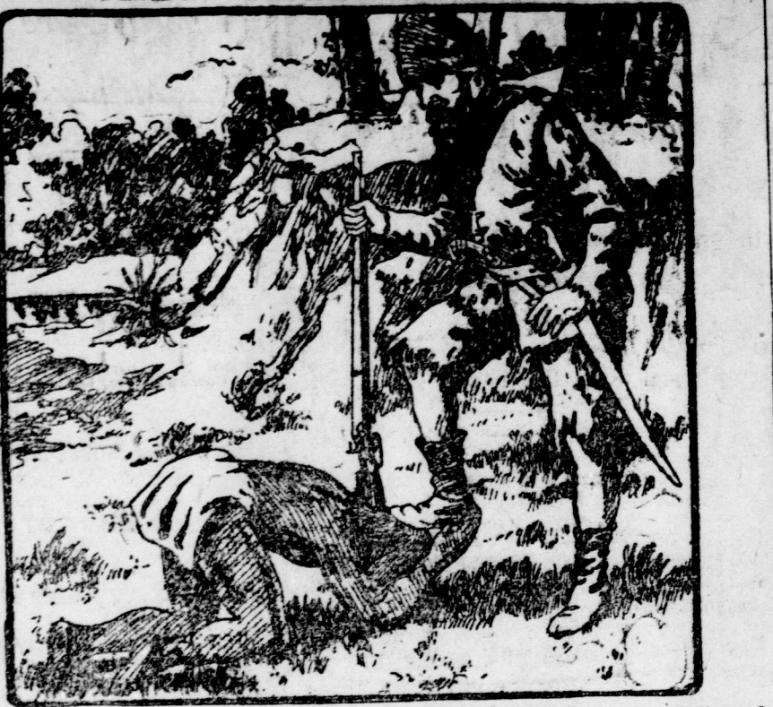
Find the two other cannibals from whom Robinson Crusoe was delivered. SOLUTION OF YESTERDAY'S PUZZLE. The father in under tree limb, the mother in branches of young tree.