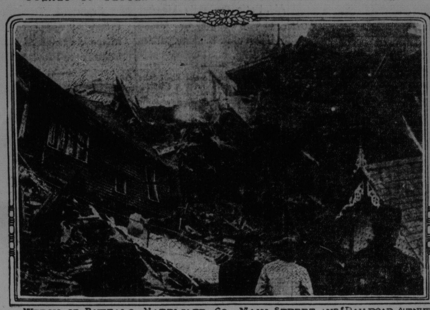
WERCK OF BUFFALO HARDWARF, CO MAIN STREET AND RAILROAD AVENU