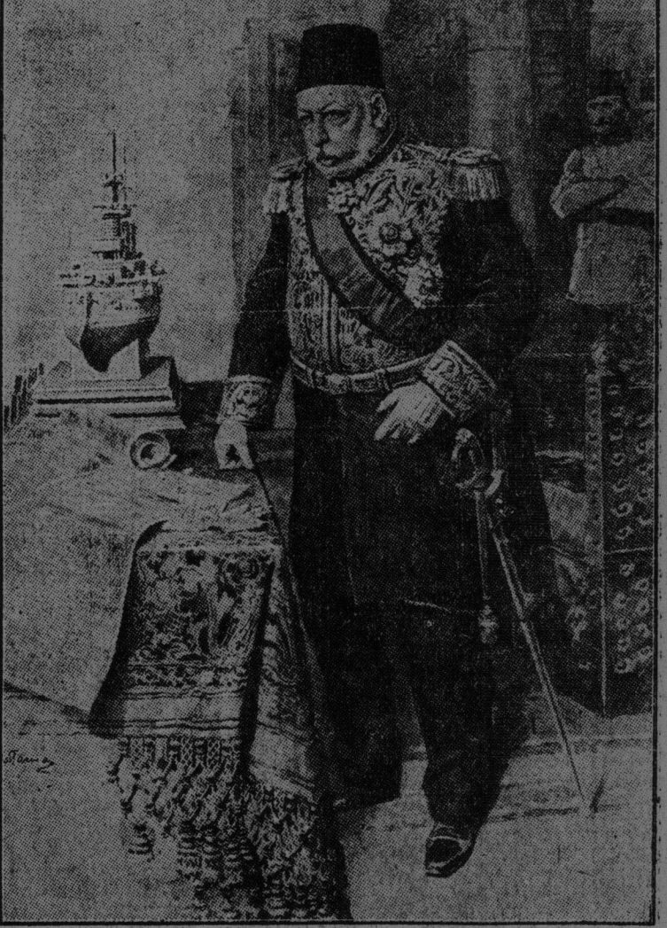
The Father of the Faithful, Mohammed Fifth.—This picture, drawn by F. Matia in the London Sketch, from the most recent photographs of the Sultan of Turkey, is characteristic of the present situation.