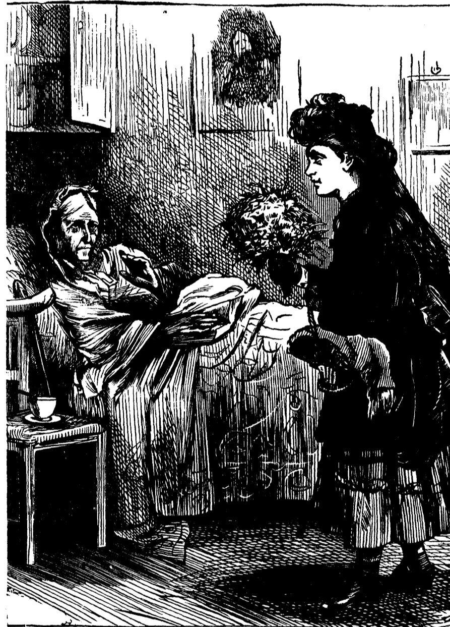
"VISITING THE SICK."

"There is a certain amount of mystery," continued Mr. Allbright. "But that you will not mind, and I may mention, lastly, that should you, after the residence of a week or two, desire to withdraw from the engagement, you will be at liberty to do so, and all expenses will be liberally paid. But I do not think that will come to pass. We happen to know enough of Mrs. Lutestring to absolve us from the necessity of appealing to any other reference, and are strongly of opinion that both parties will be gainers by this most satisfactory arrangement. If convenient you can go down to-morrow."