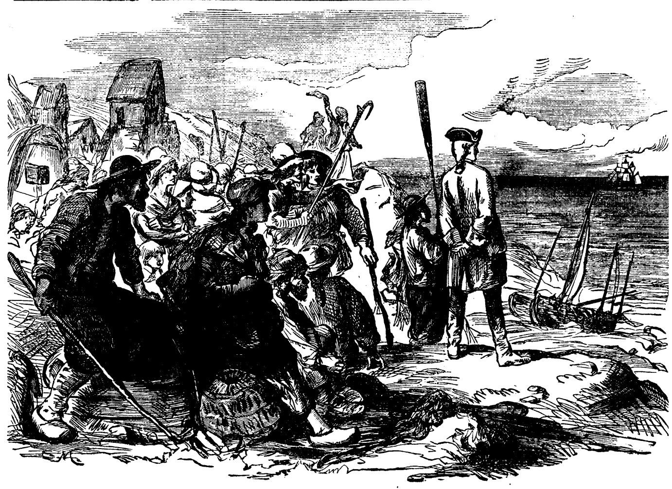
The Fishers of Bar-sur-bee.