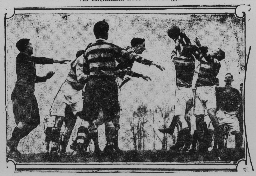
AN EXCITING MOMENT IN A STRUGGLE FOR THE BALL Roselyn Park public schools and St. Edmundians meet in a rugby match at Richmond, England.