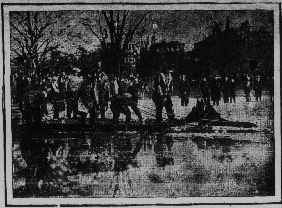
HURSE IS RESCUED BY FIREMEN AFTER MAKING TOT PLUNGE IN PARK LAKE Members of the Boston fire department rescued a borse which plunged through the ice while hauling an ic scraper over the frozen surface of the pond in the Boston public gardens.

as I write, battle cruisers and other fighting craft are lying in the Firth,