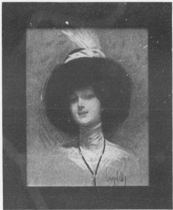
"SARA STANLEY WORE A SMART NEW TRAVELLING SUIT AND A BLUE FELT HAT WITH A WHITE FEATHER." (See page 366.)