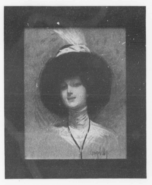
"SARA STANLEY WORE A SMART NEW TRAVELLING SUIT AND A BLUE FELT HAT WITH A WHITE FEATHER." (See page 366.)