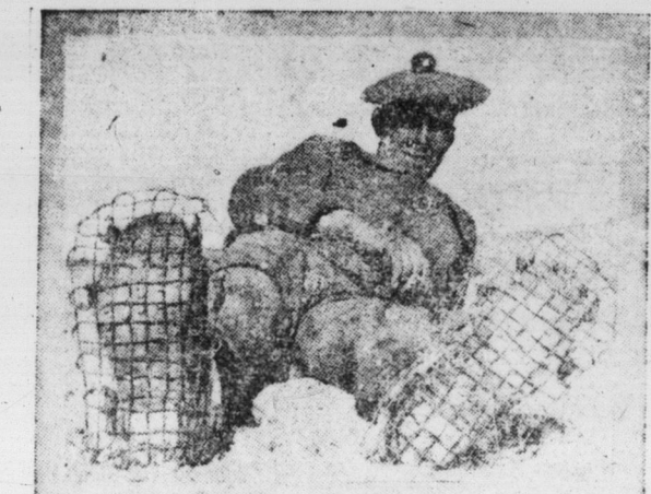
The Sand-shoes Used by Our Soldiers in Palestine When Negotiating the Sand of the Desert.

AERIAL FORCES CO-OPERATED IN BATTLE SOUTH OF SOMME A despatch from London says:—British aerial forces co-operated with land forces in Thursday's attack against the Germans south of the Somme, according to an official statement on aviation operations issued Friday night. Eleven German airplanes were destroyed and ten driven down out of control as a result of combats. Four British machines are missing.