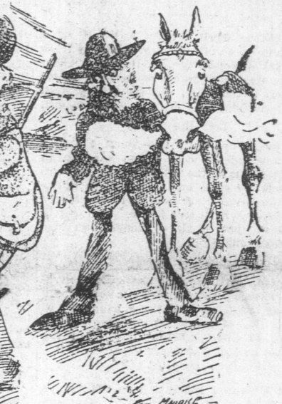
THE REASON WHY THEY TALK PEACE.

'Oh, dear! Two thousand more Canadians. I think we had better surrender before they come.'