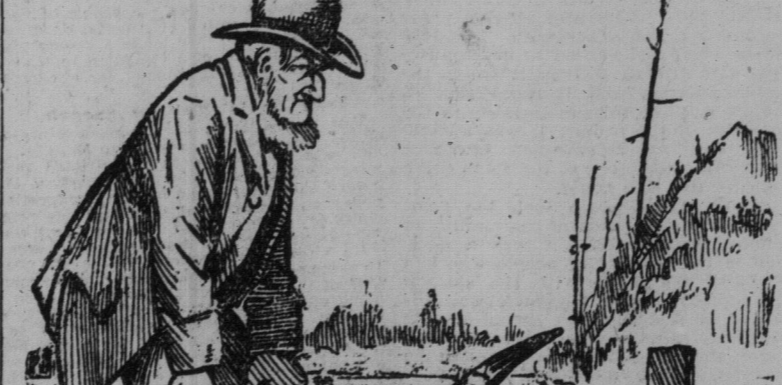
Manitoulin Member Around the Court House and Says He Feels Good.